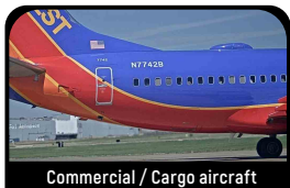
Commercial / Cargo aircraft