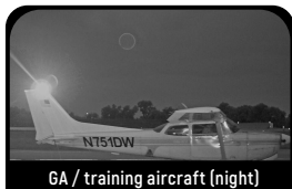
GA / training aircraft (night)